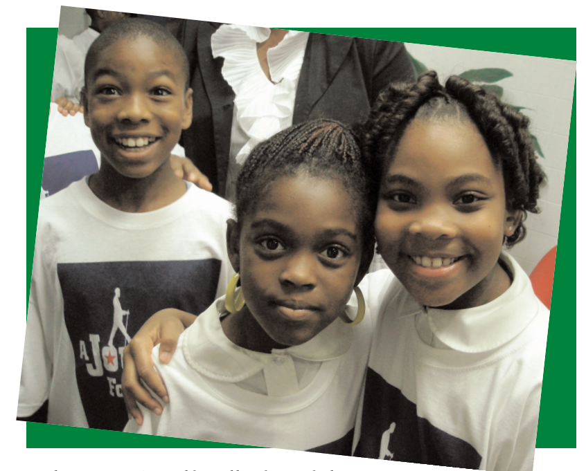
Students from D.C.'s Friendship Public Charter School - Chamberlain Campus